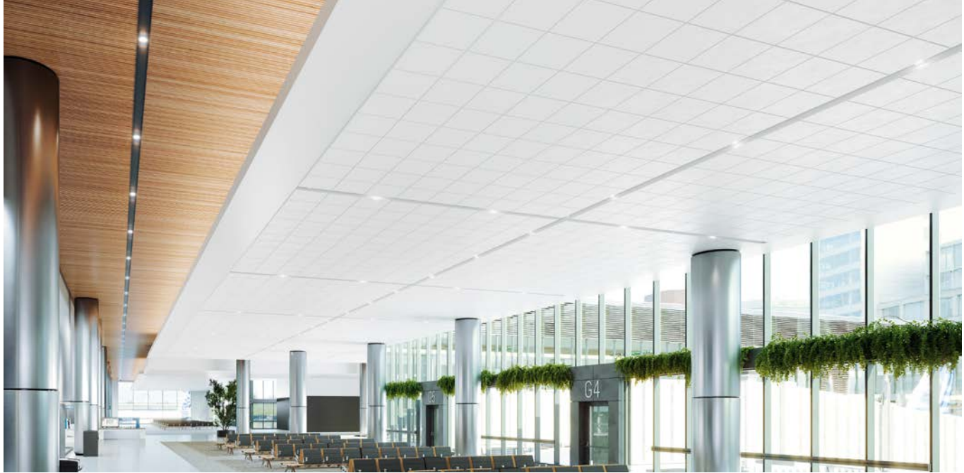
Axiom Design Troughs in White and Black

Axiom® Design Troughs are standardized extruded aluminum solutions that simplify ceiling channel design while delivering a clean, integrated aesthetic that elevates the overall ceiling design.