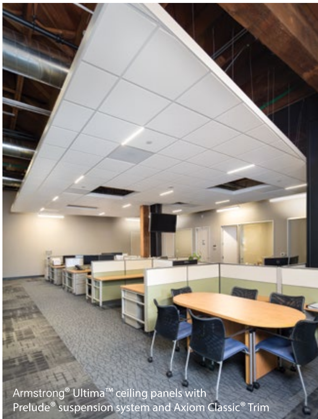
Armstrong® Ultima™ ceiling panels with Prelude® suspension system and Axiom Classic® Trim

(Installation saving cost analysis prepared by McMillan Electric Co.)