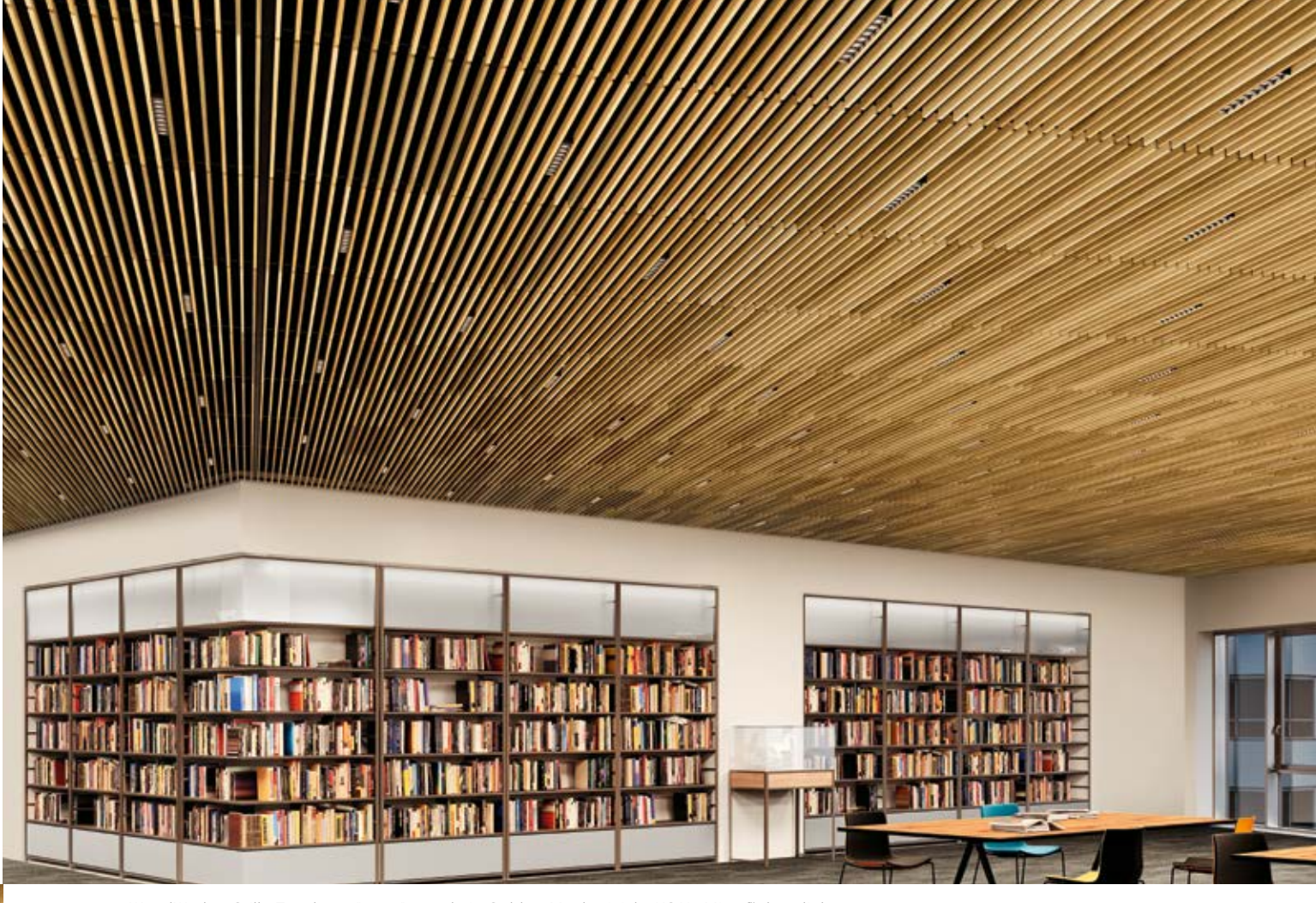
WoodWorks® Grille Tegular 24" x 48" panels in Golden Maple finish; USAI® Micro™ downlights

The Sustain® portfolio makes selecting ceiling and wall solutions that meet sustainability criteria easier and less time consuming at scale. You'll find solutions for every design goal, with easy-to-specify products that clearly communicate transparency and optimize information.