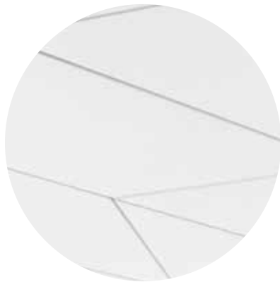
Mineral Fiber/ Fiberglass

Redefine spaces with solutions that create distinctive brand identities, blending striking design with unmatched functionality that inspire and engage shoppers.