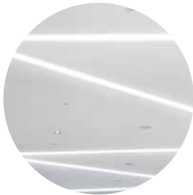
Acoustical Drywall Alternative