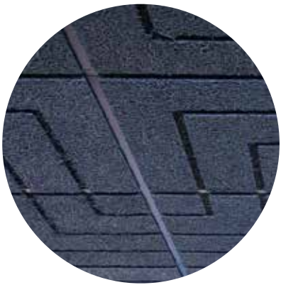
Cementitious Wood Fibers