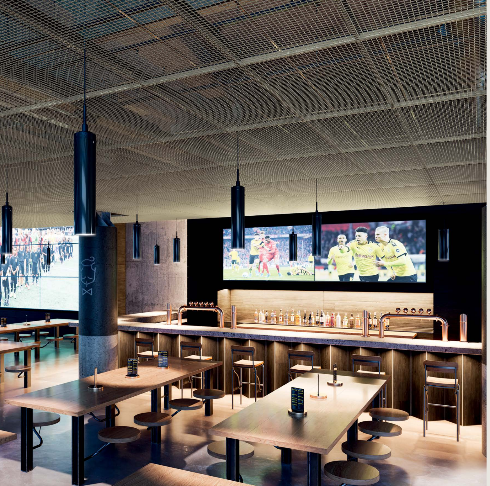
MetalWorks Mesh Torsion Spring 24" x 48", 1Cell woven panels in Gun Metal