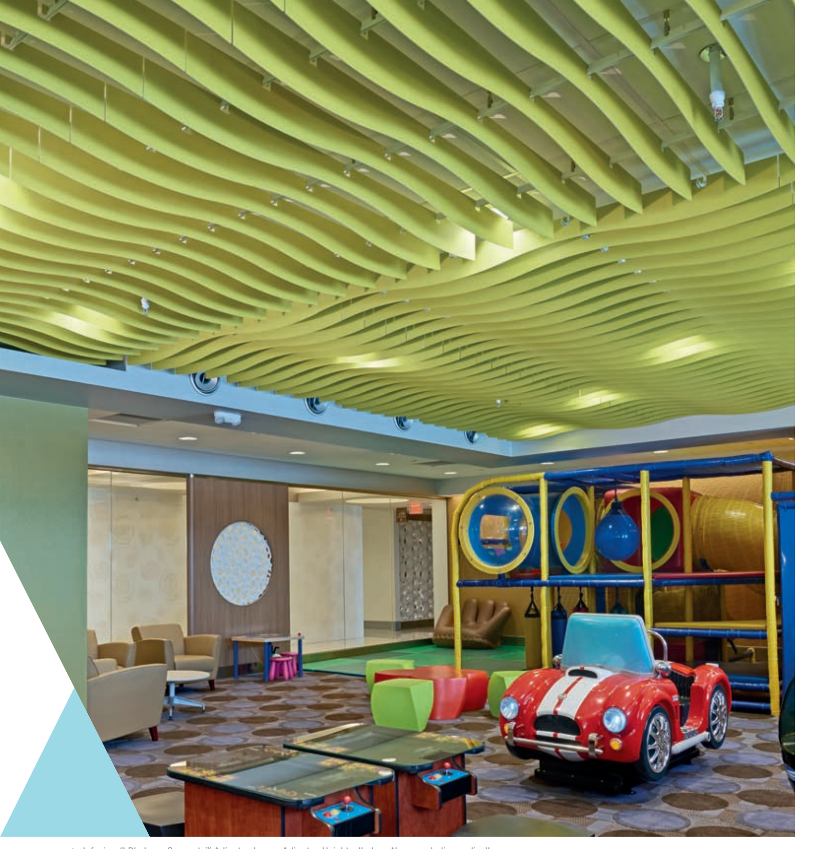
\qquad \text{Infusions}^{\circledcirc} \ \mathsf{Blades} - \mathsf{Concepts}^{^{\intercal}} \ \mathsf{Arlington} \ \mathsf{Lexus}, \\ \mathsf{Arlington} \ \mathsf{Heights}, \ \mathsf{IL}; \ \mathsf{Lew} \ \mathsf{Neuman}, \ \mathsf{Indianapolis}, \ \mathsf{IL}