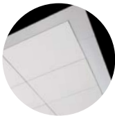
Axiom® Classic, Knife Edge®