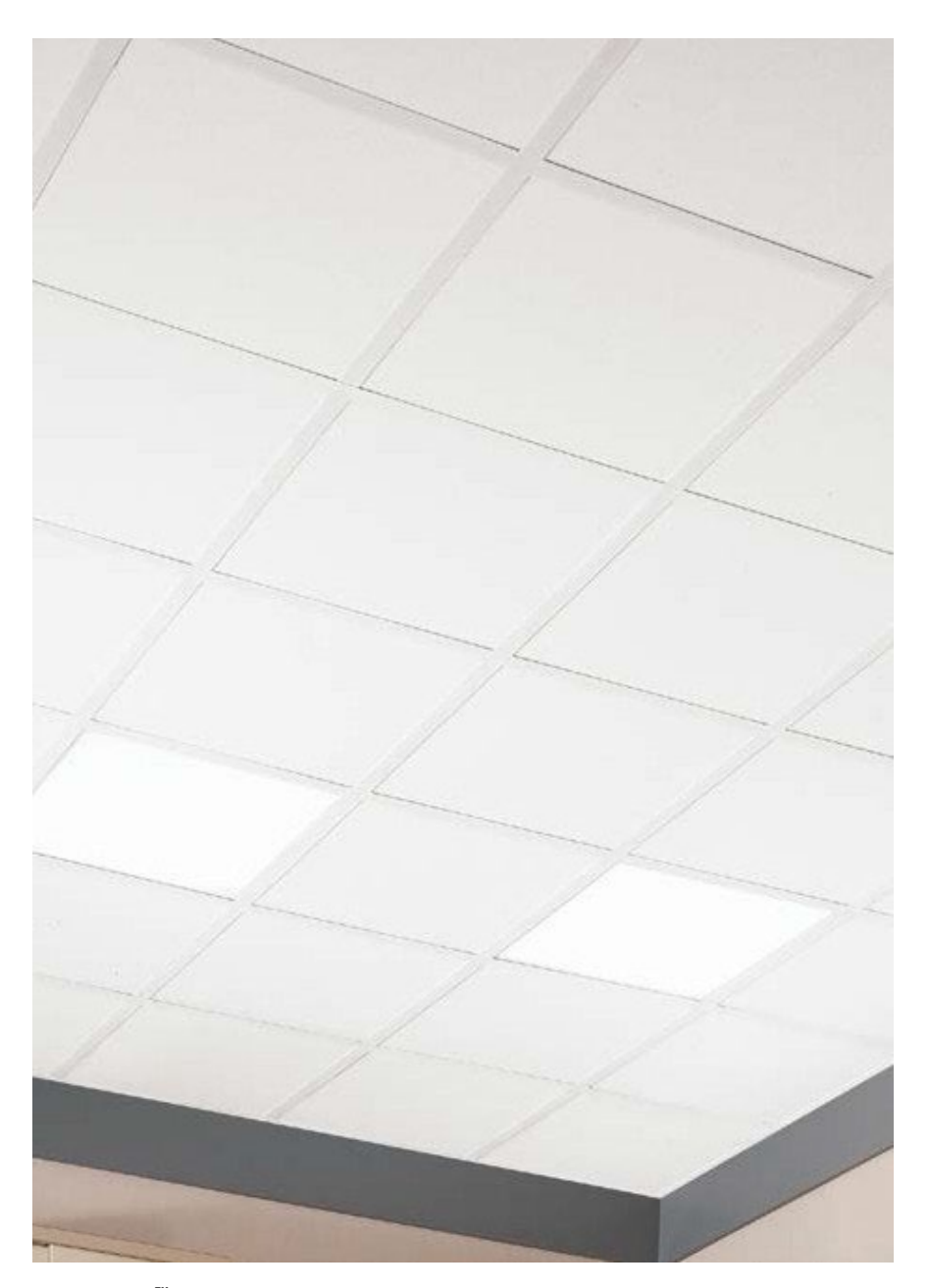
Clean Room™ FL panels with Clean Room 15/16" suspension system