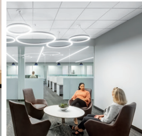
Ultima Low Embodied Carbon Beveled Tegalur panels with Suprafine XL 9/16" suspension system

Find solutions for reducing carbon in the built environment. armstrongceilings.com/carbonreduction