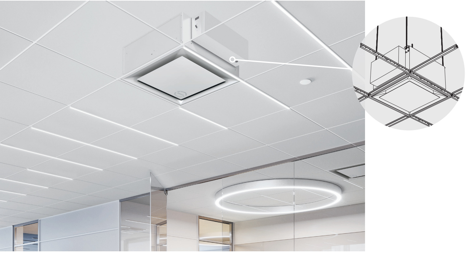
StrataClean IQ<sup>®</sup> Air Filtration System with Ultima® Health Zone<sup>®</sup> ceiling panels installed on 9/16<sup>®</sup> Suprafine® XL<sup>®</sup> suspension system

The quiet Armstrong StrataClean IQ<sup>™</sup> Air Filtration System captures airborne contaminants, allergens, and particulates to create cleaner, healthier, Indoor Air Quality (IAQ) for every space using proven MERV 13 filtration<sup>†</sup>.