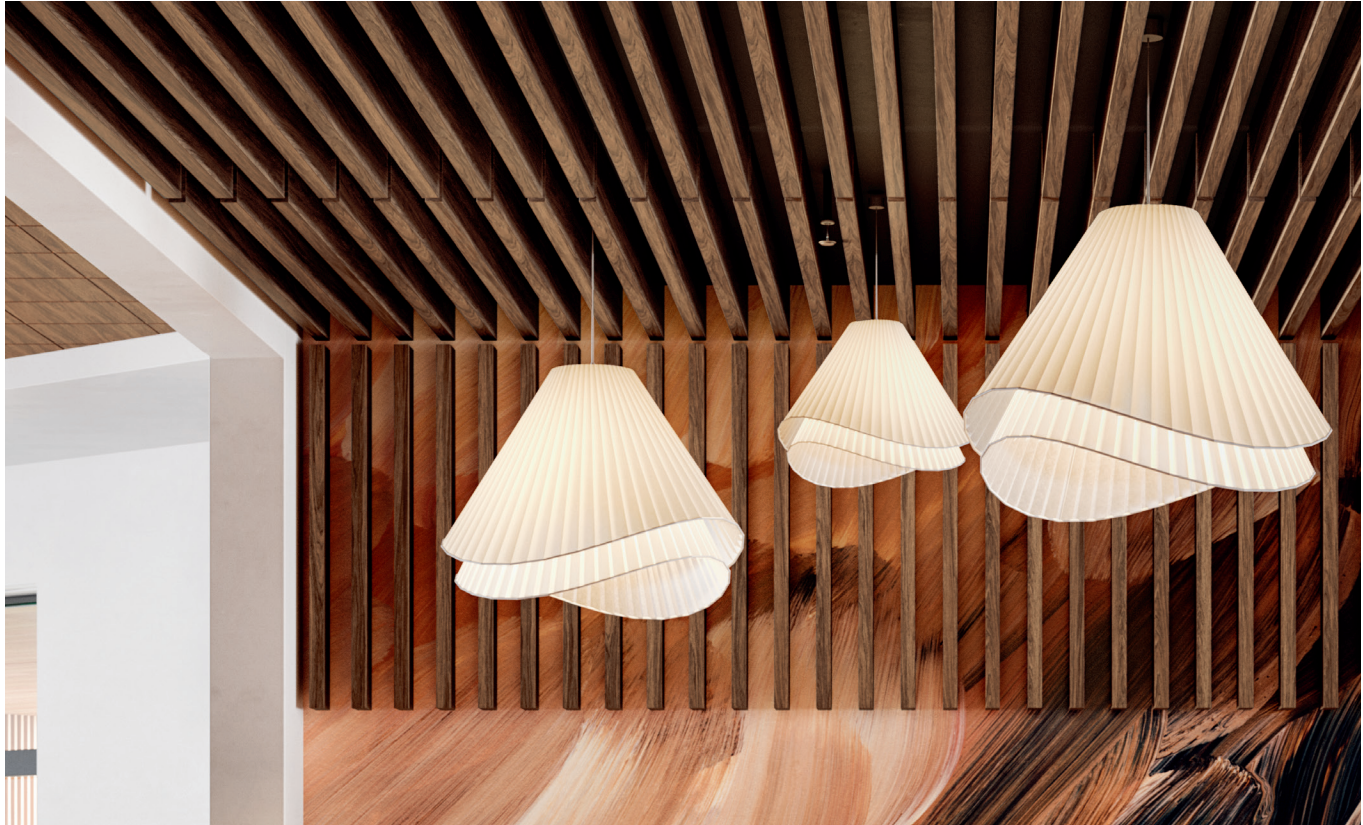
SoundScapes Blades wood-look wall panels in Brown Sugar Walnut (WBS)

Linear acoustical wall panels help reduce reverberation time in your space.