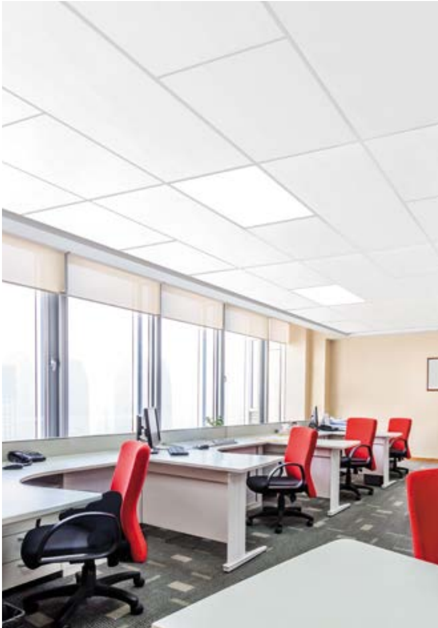
Lyra® Square Lay-in panels with Suprafine® 9/16" suspension system