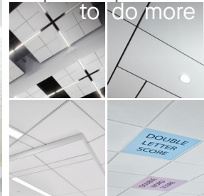
Ultima® Beveled Tegular panels with Silhouette® 1/4" reveal 9/16" suspension system

armstrongceilings.com/capabilities See more photos at: armstrongceilings.com/photogallery