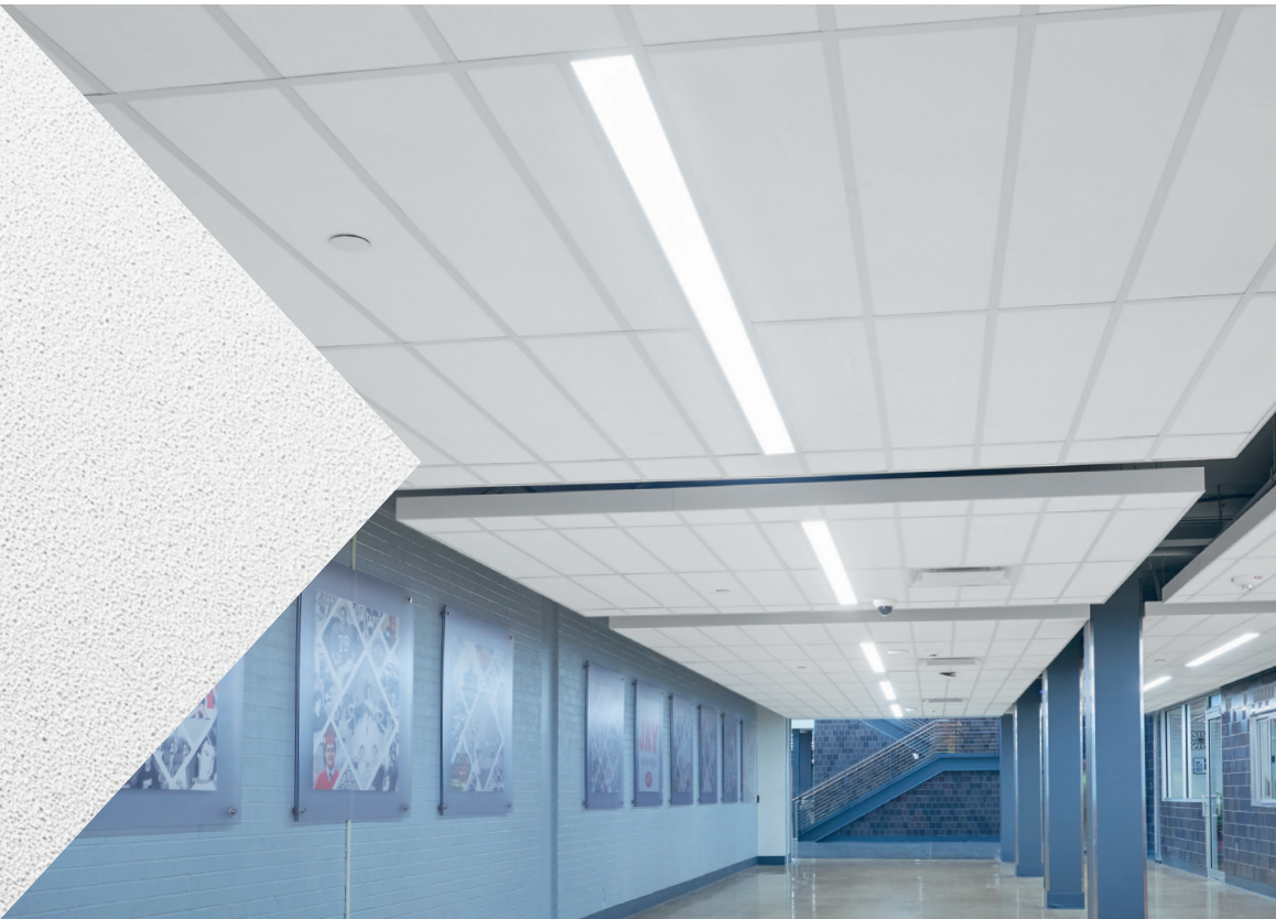
Ultima Square Lay-in panels with Prelude XL 15/16" suspension system

CAD/Revit® drawings at: armstrongceilings.com/cadrevit