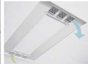
VidaShield UV24™ System for Ultima® Health Zone™