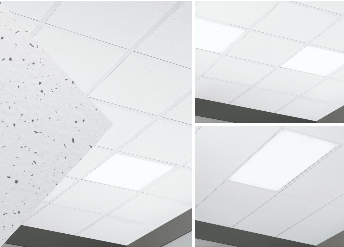
Clean Room FL panels with Clean Room 15/16" suspension system

CAD/Revit® drawings at: armstrongceilings.com/cadrevit